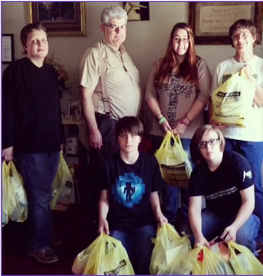
TNT group delivering items to Christos House. These items were purchased from money raised from cookbook sales. We are proud of you and all of your hard work!